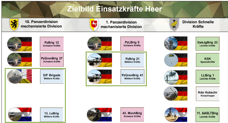
Figure 1 Organigram of German army divisions with Dutch units incorporated

Importantly, this does not mean that the Dutch brigades are commanded by German divisions on a permanent basis. Dutch forces remain primarily garrisoned in the Netherlands, and certain tasks (e.g. personnel policy) remain under national control. Both German and Dutch forces remain under national control and constitutional arrangements. 100 It must be noted that changing command relationships, especially at the brigade level and above, is standard procedure within NATO. The fact that units are assigned to higher level formations does not automatically mean that these units cannot be separately deployed. The assignment of brigades and divisions within particular arrangements, be it through NATO (German-Dutch formations have important roles assigned to them in the new NATO plans, see §3.1) or in a German-Dutch context, implies a commitment to provide forces if a decision is taken to use force and an agreement is reached on the activation of the combined command arrangements by the chiefs of defence.