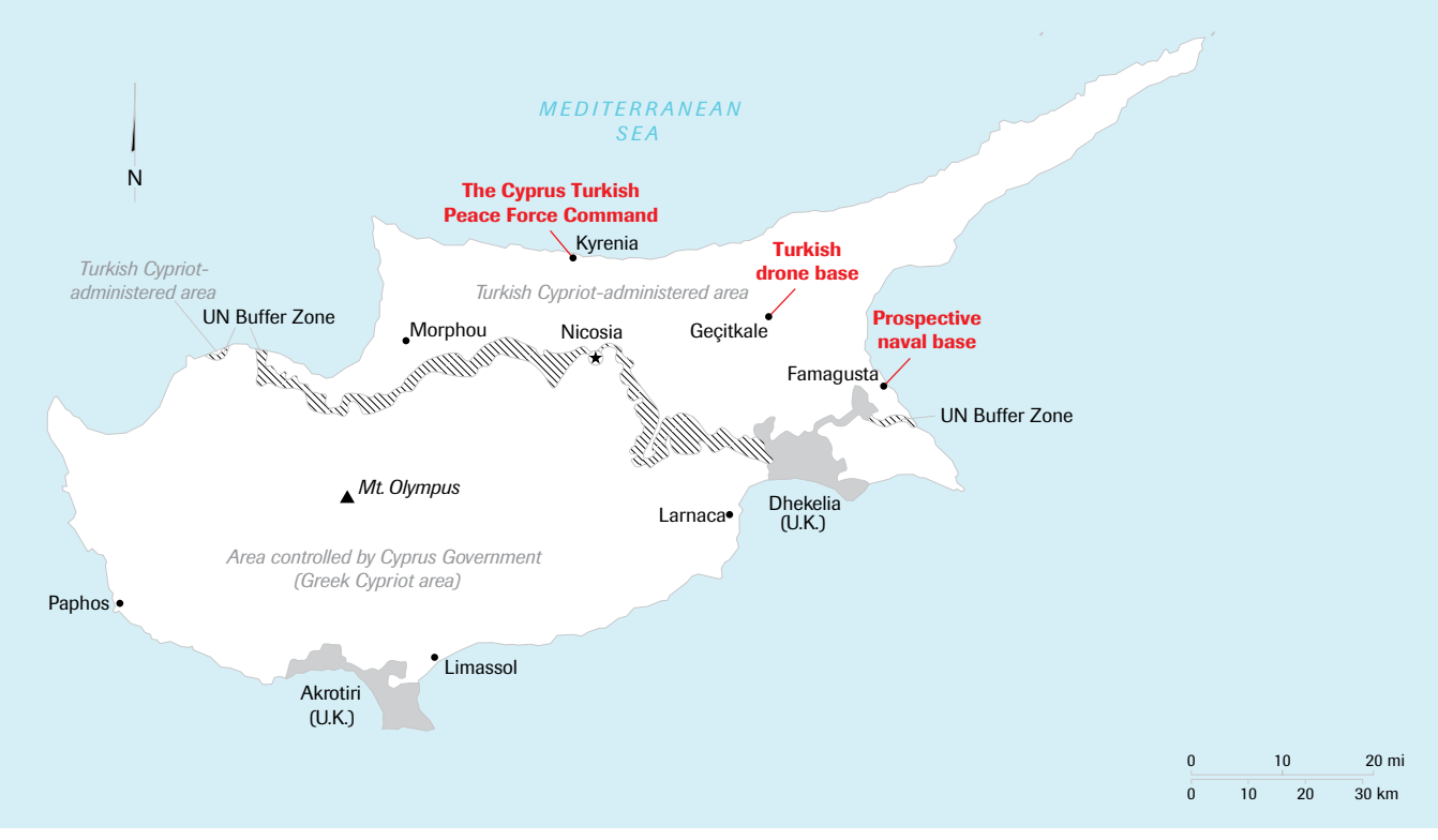
Figure 2 The current political-administrative division of Cyprus