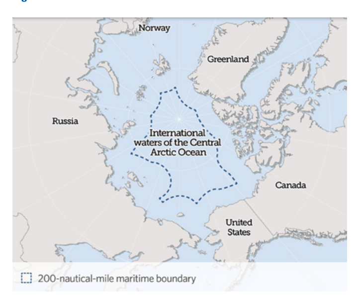
Figure 4 The Central Arctic Ocean<sup>51</sup>

Third, opportunities for commercial fishing in the international waters of the Central Arctic Ocean (CAO) are likely to increase in the coming years, because climate change is causing major fish stocks (e.g. cod and halibut) to migrate further north as their habitats in lower latitudes become warmer.<sup>47</sup> However, economic competition or significant Arctic fisheries are unlikely to develop, because the most commercially important sub-Arctic species live within the EEZs.<sup>48</sup> Moreover, in October 2018 the EU and nine other countries<sup>49</sup> signed the International Agreement to Prevent Unregulated High Seas Fisheries in the Central Arctic Ocean, prohibiting commercial fishing in the CAO for the next 16 years.<sup>50</sup>