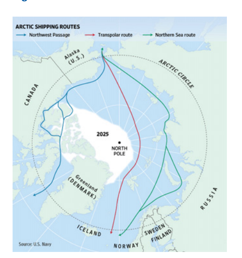
Figure 2 The three Arctic sea routes<sup>41</sup>

Second, the Arctic is known to contain abundant resources. The US Geological Survey estimated in 2008 that the Arctic seabed contains about 13% of the world's remaining undiscovered oil, 30% of undiscovered natural gas, and 20% of undiscovered natural gas liquids. <sup>42</sup> Most of the areas known to contain gas and oil resources, approximately 90%, are located on states' continental shelves and are therefore already within their uncontested Exclusive Economic Zones (EEZ). <sup>43</sup> Oil and gas reserves are predominantly located offshore, which makes extraction difficult and requires expensive 'state of the art' technology. Therefore, the extraction of Arctic gas remains economically less attractive than other (shale) alternatives. <sup>44</sup> Apart from oil and gas, various minerals and coal resources are also to be found in the area. Overall, Arctic resources are becoming more accessible due to thawing ice, yet their exploitation and development remain dependent on technological innovations, global supply and demand dynamics, market prices and political agreements. In terms of resource locations and the security challenges that come with extraction and economic potential, the Arctic region presents a varied picture (see Figure 3). In the Norwegian and Russian parts of the Barents Sea,