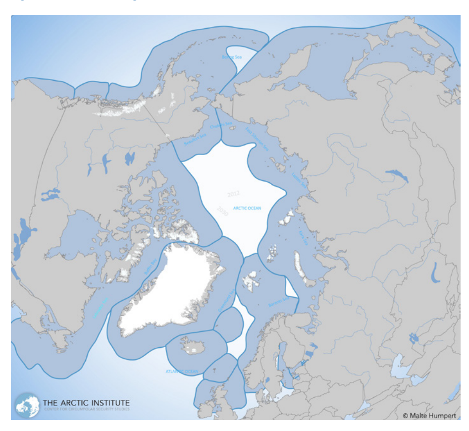
Figure 1 The Arctic region (Extended Economic Zones)<sup>12</sup>

Various studies have tried to estimate when the first ice-free months will occur. If the global emission trajectory remains as it is, and if states fail to reduce greenhouse gas emissions as needed to reach the objective of the 2016 Paris Agreement, ice-free conditions are likely to appear in the coming decades. Due to natural climate fluctuations the projection of the first occurrence of a seasonally ice-free Arctic Ocean comes with a 21-year uncertainty window (2032-2053).<sup>13</sup>