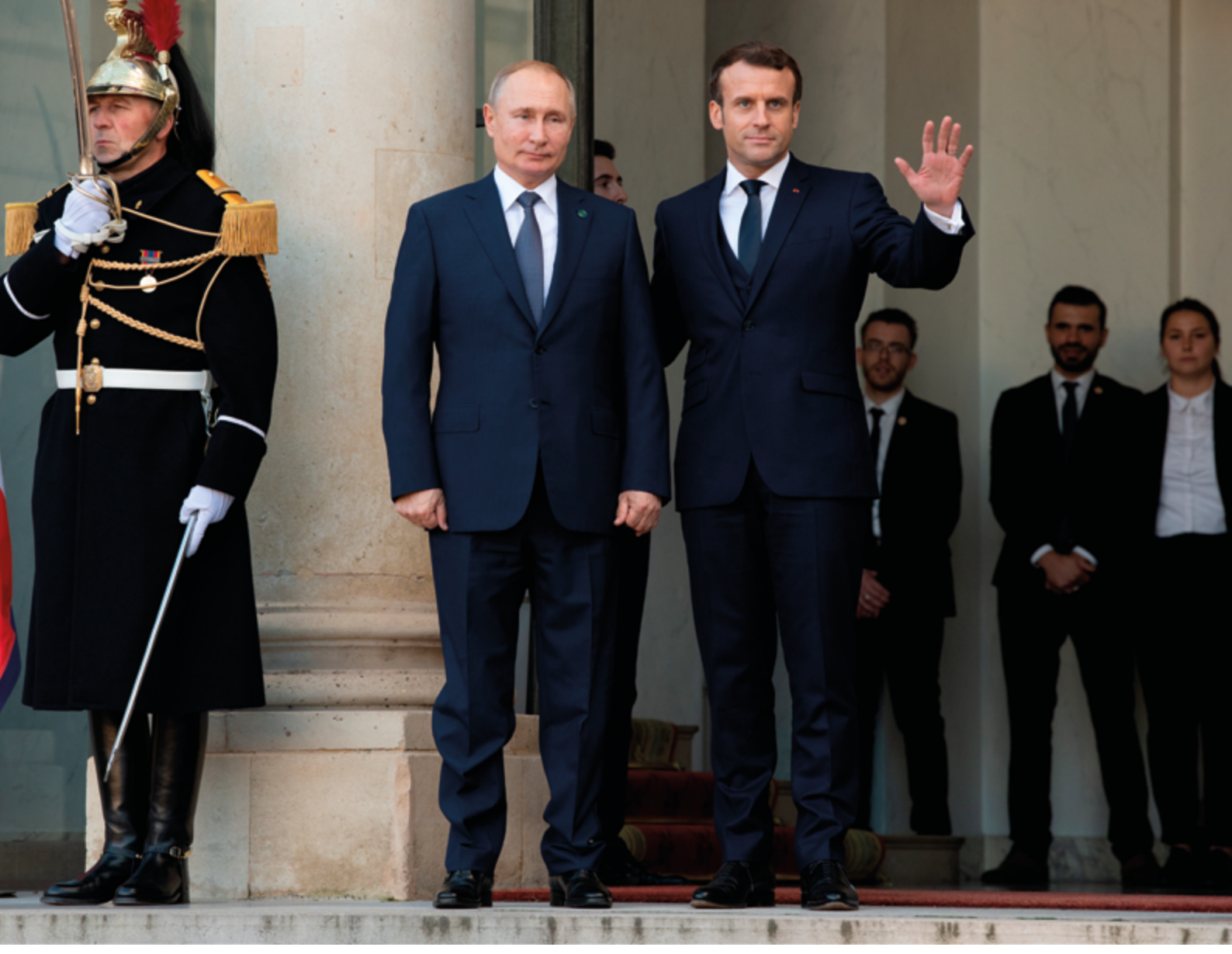
9 December 2019: President Emmanuel Macron together with President Vladimir Putin at the Elysée Palace. French President Macron has taken the initiative to reanimate negotiations on a political settlement of the Ukraine crisis in the 'Normandy Format'

opportunities for cooperation have gradually increased. The deadlock in EU-Russia relations also hampers the EU in becoming a stronger player in its own Eastern and Southern Neighborhoods and in its efforts to contribute to conflict resolution, as in Syria and Libya. It seems impossible to solve any of these conflicts without involving Russia.