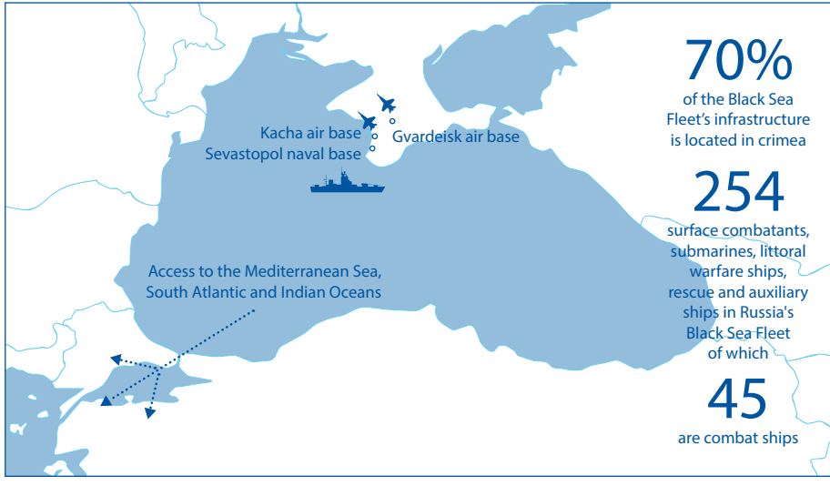
Figure 2 Crimea's strategic importance for Russia

Official EU policy (March 2015) is based on the premise that 'restrictive measures against the Russian Federation [...] should be clearly linked to the complete implementation of the Minsk agreements. [...] The European Council does not recognize and continues to condemn the illegal annexation of Crimea and Sevastopol by the Russian Federation and will remain committed to fully implement its non-recognition policy'.14 This unequivocal stance quickly became the mantra within all of the EU member states. Dutch Minister of Foreign Affairs Bert Koenders echoed this official statement in September 2015: 'Sanctions remain necessary while Russia refuses to implement the Minsk agreements to resolve the conflict in eastern Ukraine. There is also a separate set of sanctions for Crimea, which will remain in place as long as Russia continues its illegal annexation'.15 This stands in stark contrast to President Putin's statement in March 2014 that 'Crimea is our common historical legacy and a very important factor in regional stability. And this strategic territory should be part of a strong and stable sovereignty, which today can only be Russian'.16 On the future of Crimea, the EU and Russia are clearly at loggerheads. Policy-makers on both sides have formulated their positions in tough, uncompromising terms, making it hard to see room for flexibility and a diplomatic trajectory towards the 'middle ground'.