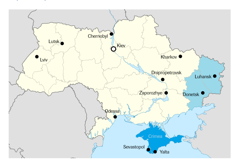
Map 1 Map of Ukraine