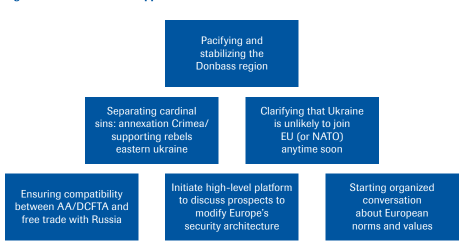
Figure 3 A constructive approach towards Russia

What does this mean for EU policy towards Russia? First , the EU should ensure that Ukraine's AA/DCFTA (which is signed but not yet ratified) will be compatible with Kiev's commitments for free trade with Russia (see figure 3).<sup>48</sup> Since February 2015, no fewer than five trilateral meetings have been held (the latest in November 2015), bringing together EU Trade Commissioner Cecilia Malmström, Ukraine's Minister of Foreign Affairs Pavlo Klimkin and Russia's Minister of Economic Development Alexei Ulyukayev. The main goal of these meetings has been to 'find practical solutions to Russian concerns about the implementation of the DCFTA'.<sup>49</sup> Clearly, Brussels now acknowledges that Russia needs to be involved in any future EU–Ukraine trade deal. However, no practical solutions have been agreed, mainly because Russia has – despite