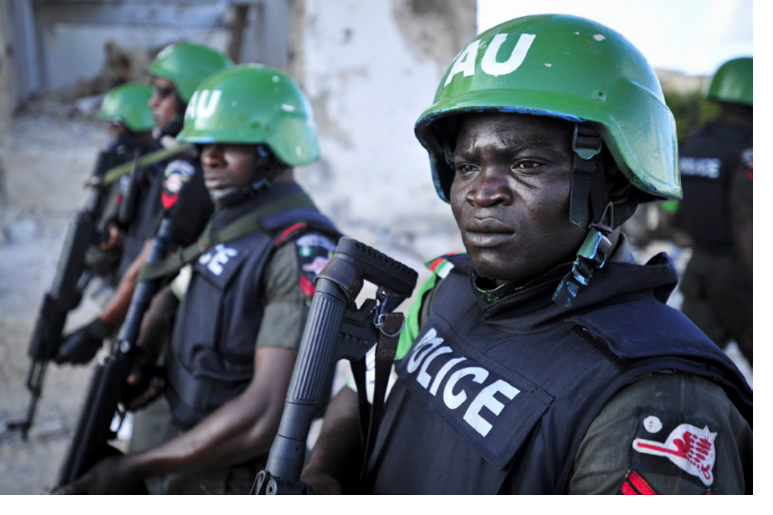
Policeagents from the African Union mission AMISOM.

the deployment of the regional Multi-National Joint Task Force in the Lake Chad basin (Nigeria, Cameroon, Chad and Niger), in which troops mostly from Chad are being deployed actively in the countries concerned.<sup>34</sup>