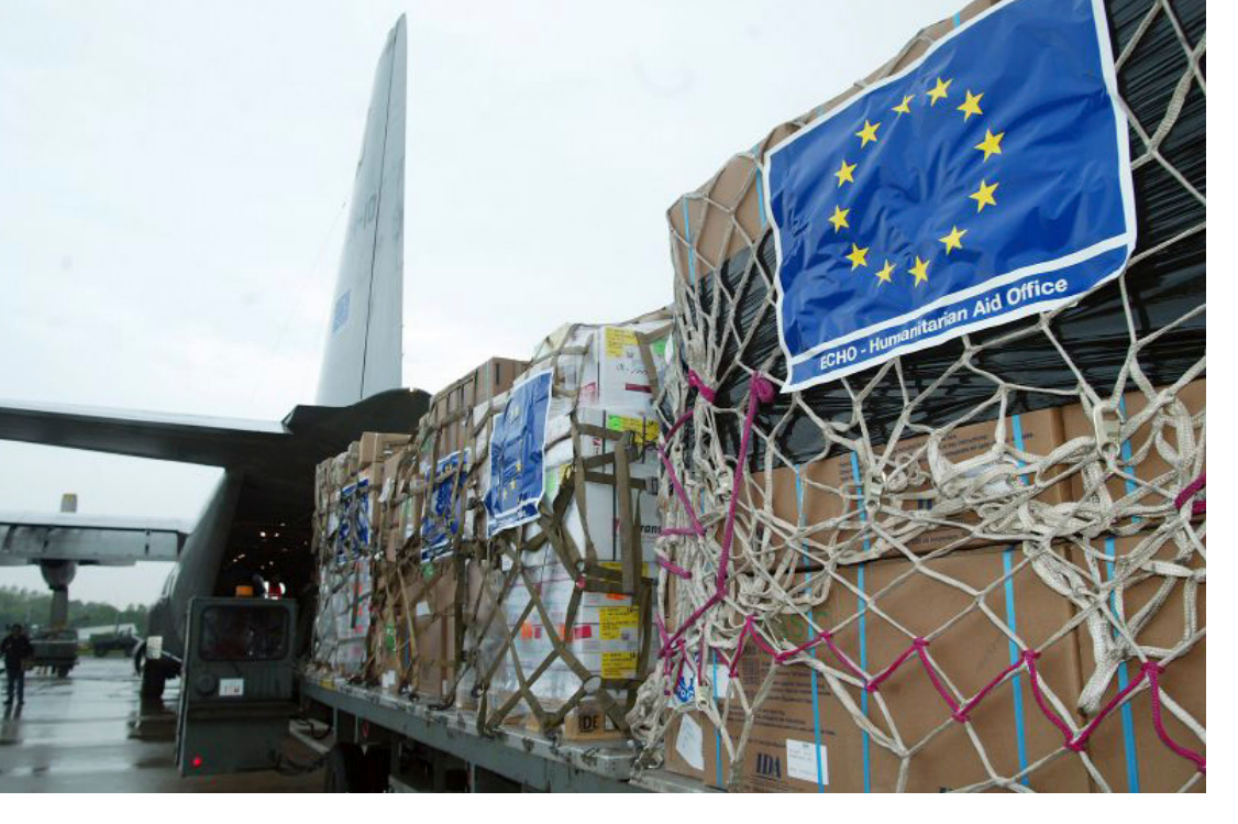
Humanitarian aid from ECHO.

because, in the words of the Commission, "[T]here is rarely enough information to make decisions and choices with full confidence. It is often necessary to engage in a more complex process whereby analysis and assessment is continuous to allow adjustment when circumstances change and/or new information and insight comes to light."<sup>56</sup> The comprehensive approach is designed to combine the strengths and capabilities of the EU optimally, adapted to the specific needs of the given situation. Moreover, through a long-term commitment, the EU wants to shift the focus to the prevention of conflict.