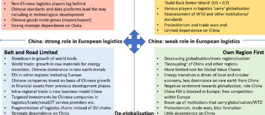
Figure S.1 Scenario outline: key points