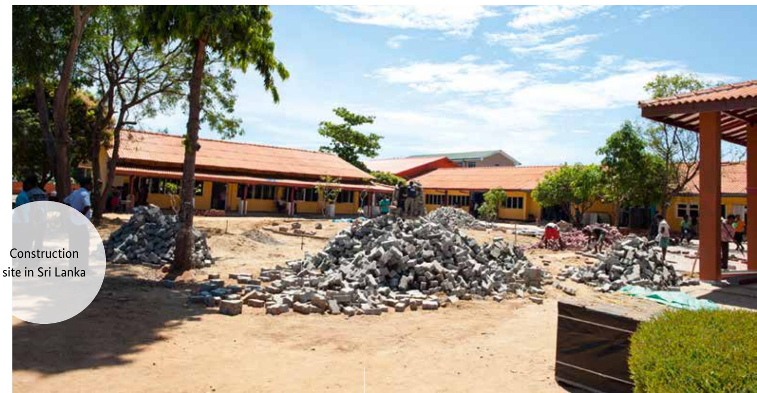
Construction site in Sri Lanka

From an employment promotion perspective, there are two ways to deal with the lack of physical infrastructure. One consists of identifying employment opportunities in sectors that are least dependent on infrastructure (e.g. the mobile phone sector). The other one aims to combine employment ambitions with the urgent need for (re)building infrastructure such as roads and electricity networks.