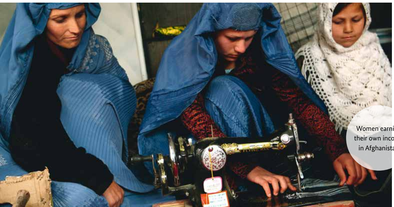
Women earning their own income in Afghanistan