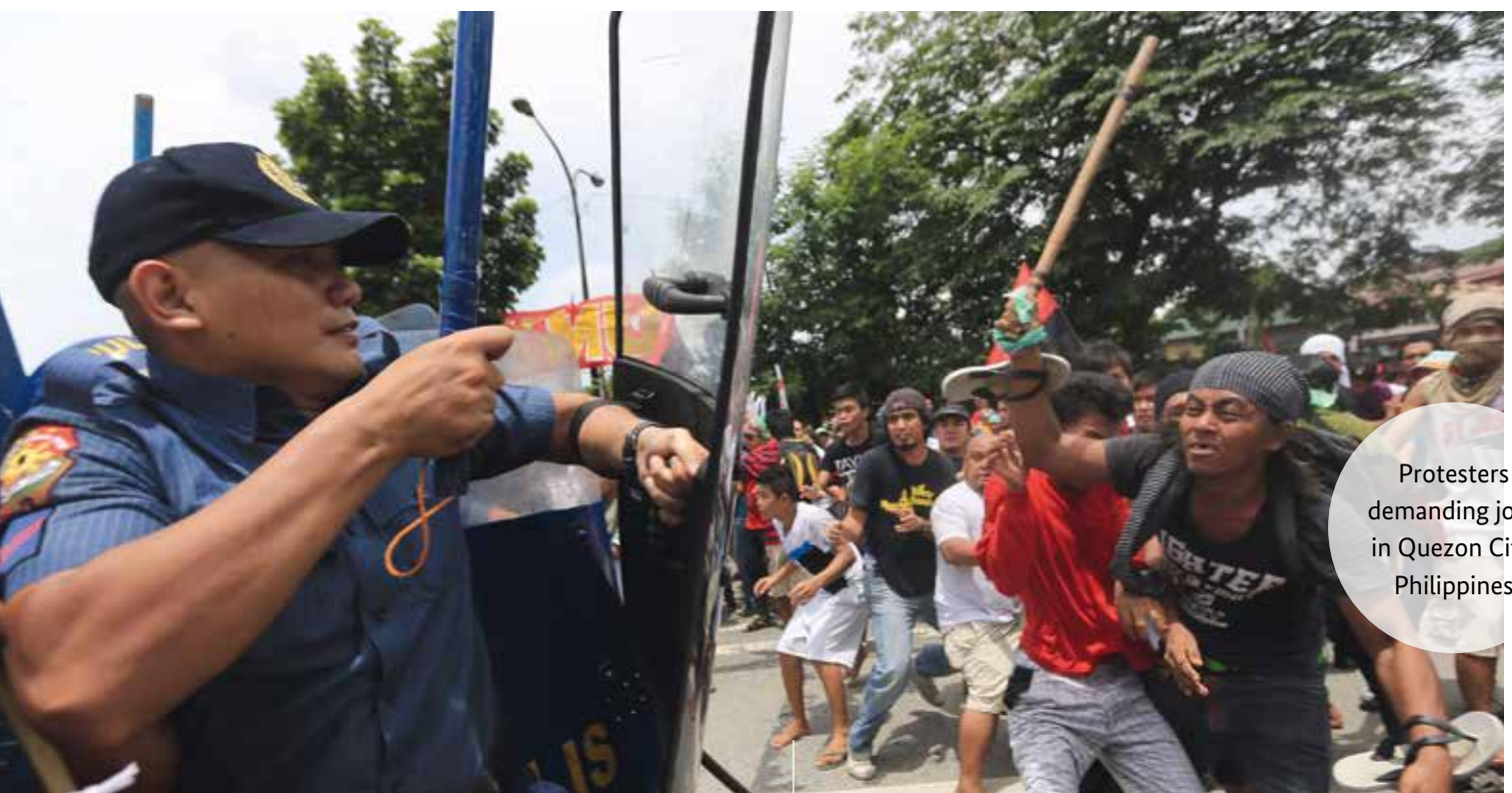
Protesters demanding jobs in Quezon City, Philippines

Addressing conflict, fragility and violence is crucial for the success of development cooperation, since their impacts affect more than half of the German partner countries (BMZ, 2013). German development policy is based on the conviction that social changes are primarily endogenous processes and that development inputs need to be embedded