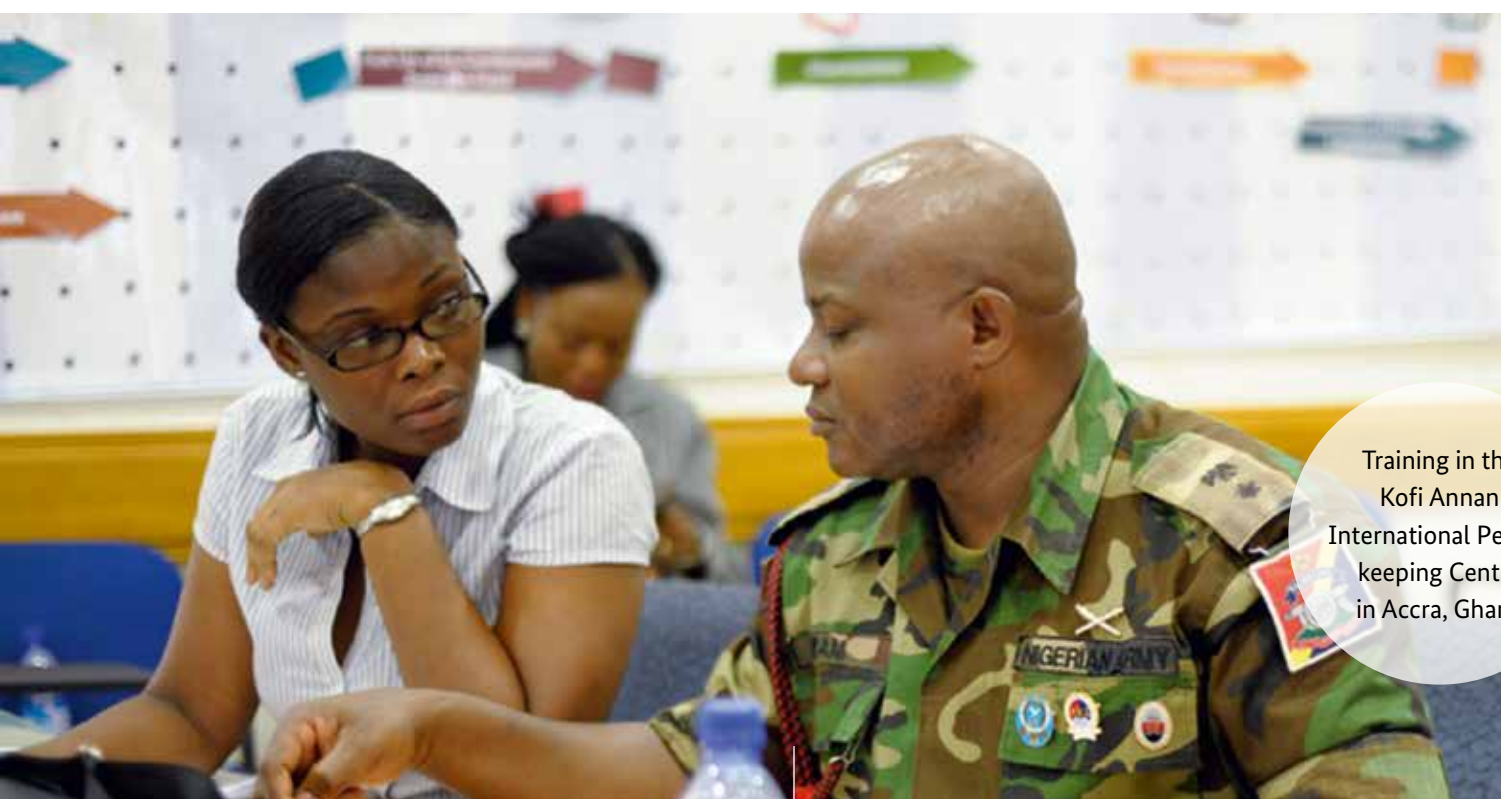
Training in the Kofi Annan International Peace- keeping Centre in Accra, Ghana

The organisation Building Markets is specialised in linking small local enterprises to international buyers, including both international humanitarian and development organisations and foreign investors in post-conflict contexts like Afghanistan and Liberia. A major area of potential lies in the field of rebuilding infrastructure. Besides training local suppliers and working with these larger buyers to make their procurement procedures accessible to local SMEs, they have developed a number of tools to improve the business matchmaking between