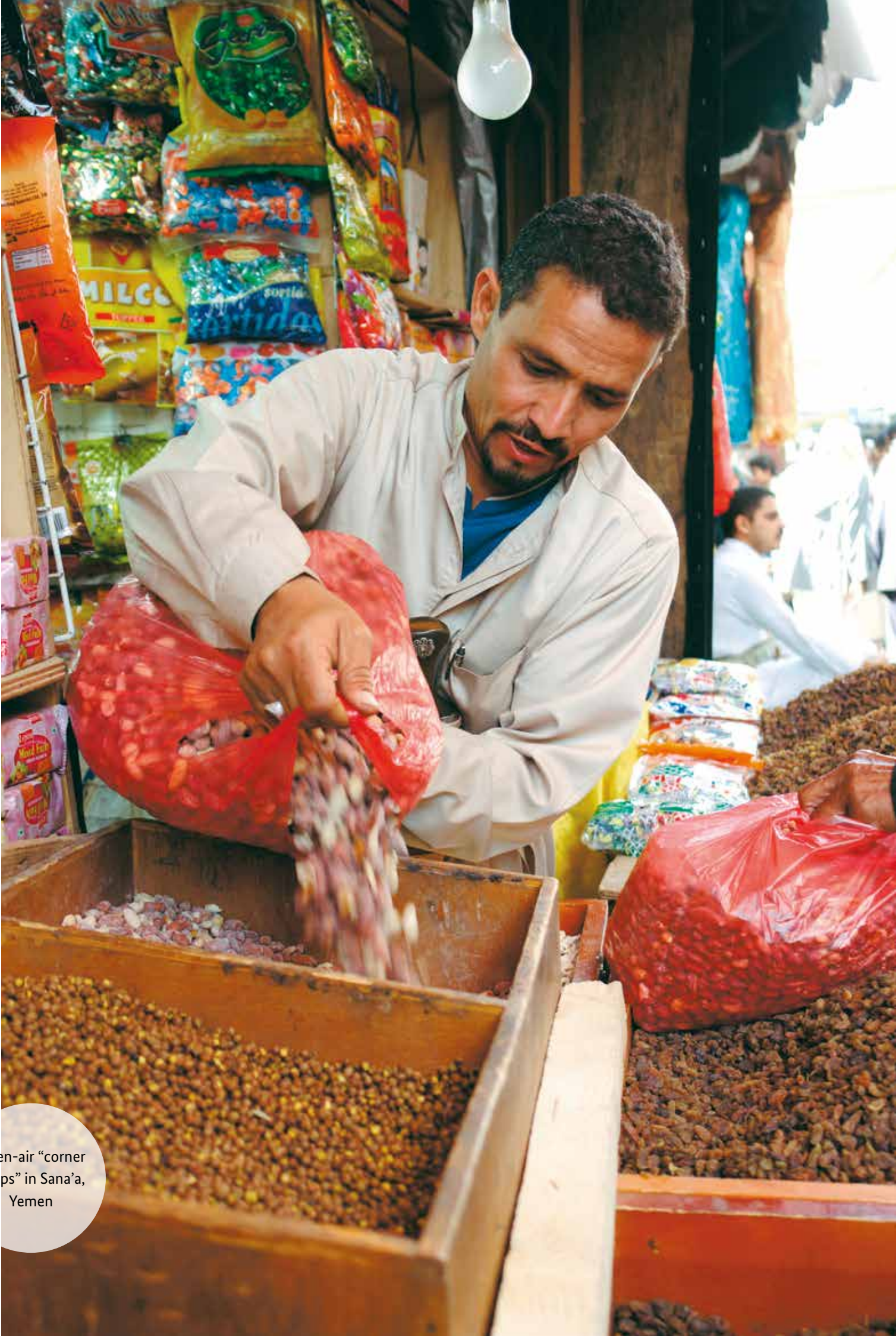
Open-air “corner shops” in Sana’a, Yemen