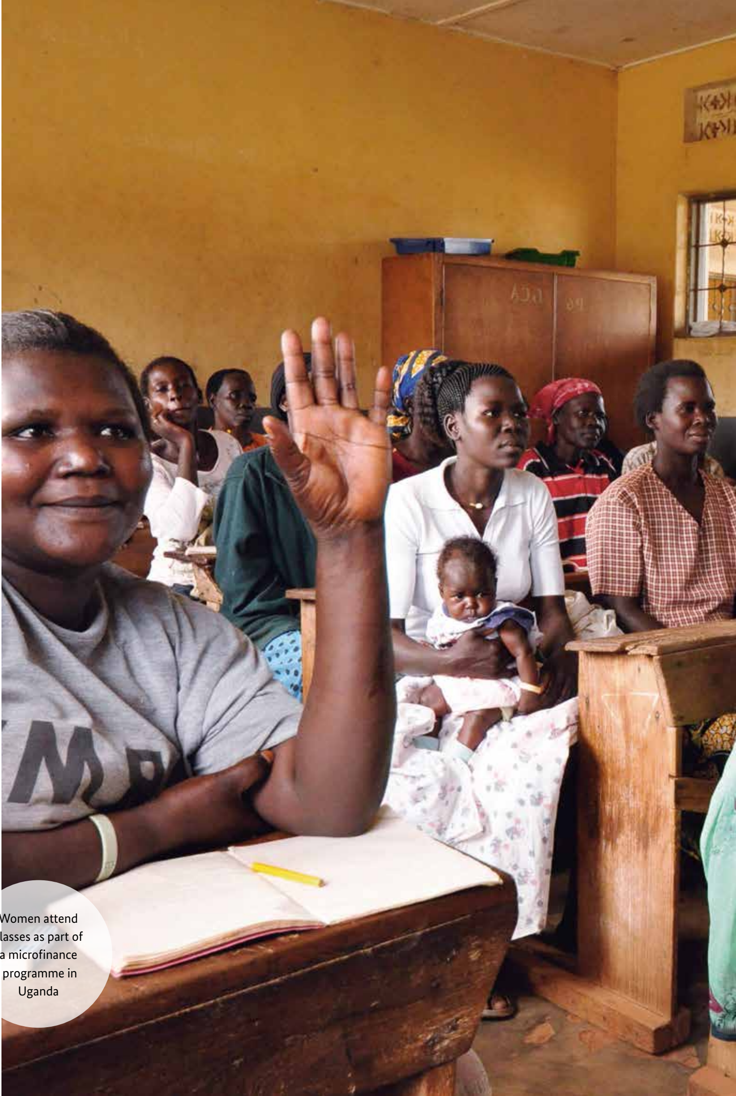
Women attend classes as part of a microfinance programme in Uganda