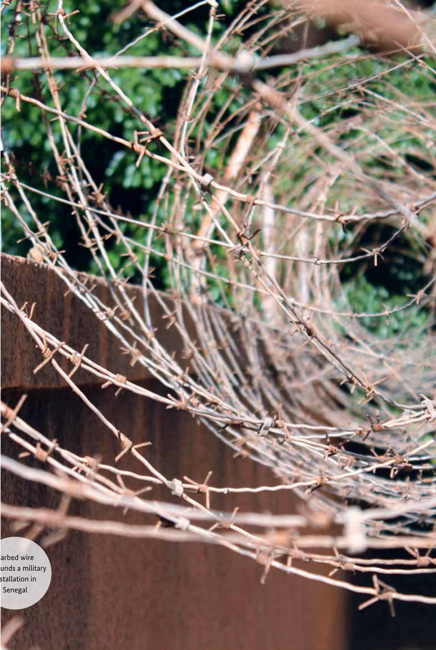
Barbed wire surrounds a military installation in Senegal