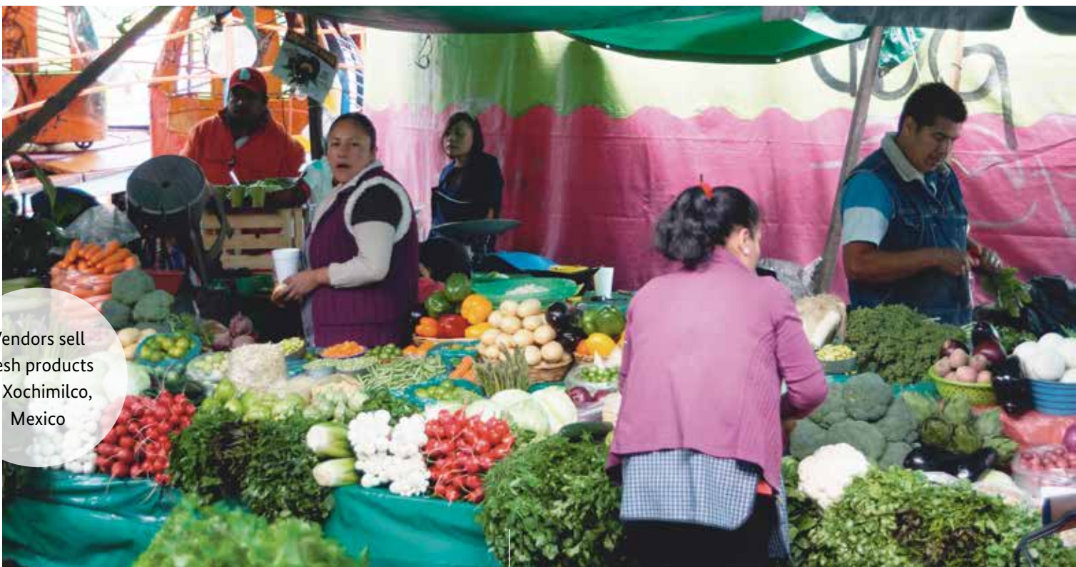
Vendors sell fresh products in Xochimilco, Mexico

Similarly, the development by a group of local firms and NGOs (the so-called ‘Consejo Ciudadano’) of a series of online, text-messaging, and mobile tools to report crimes, file complaints, and map violent areas in Mexico City greatly helped to countervail the collaboration between local police forces and organised crime. As a result, crime dropped significantly in the neighbourhoods where the tools were applied (Goldberg et al., 2014, p. 68).