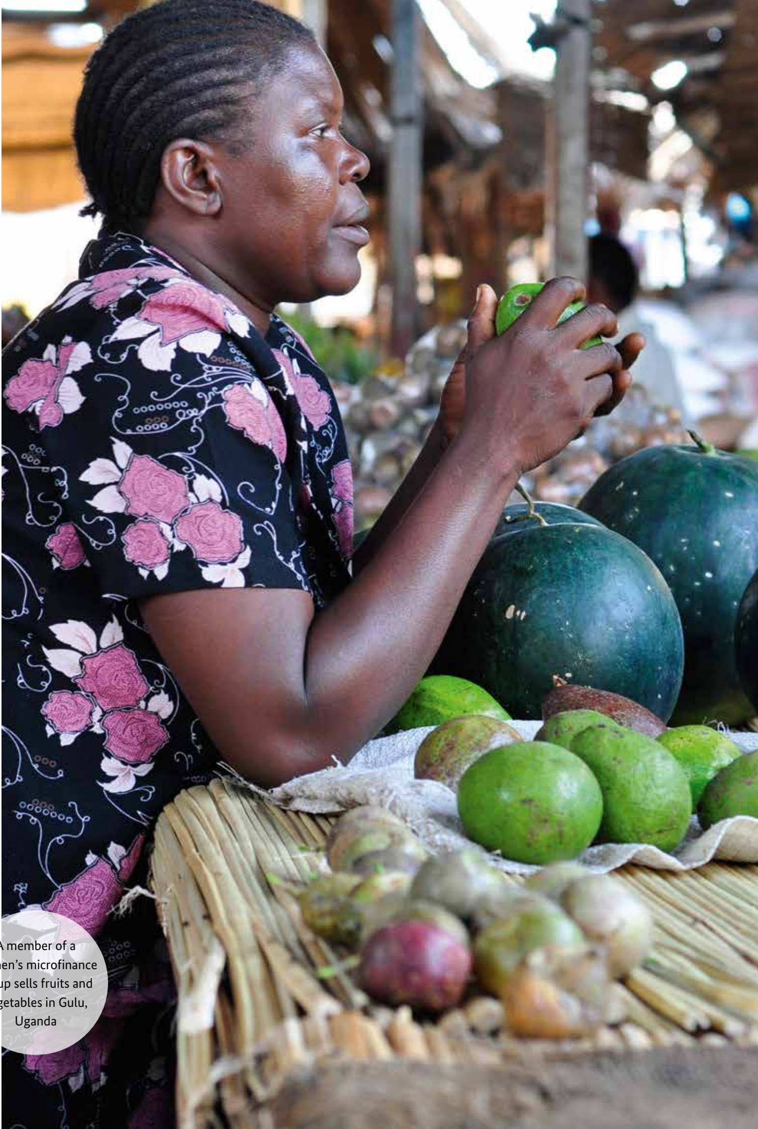
A member of a women's microfinance group sells fruits and vegetables in Gulu, Uganda