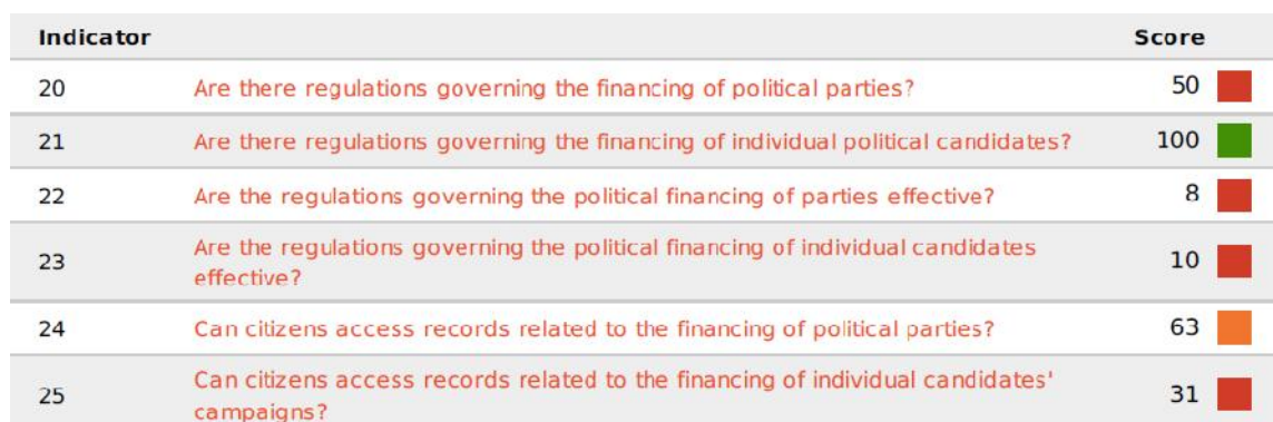
Table 1. Global Integrity indicators (2011) for the Armenian political finance regulations, scores range from 1 to 100, with the latter signifying highest positive degree attainable.

According to the Global Integrity indicators, in 2011 Armenia scored just 8 out of 100 in practical effectiveness of its party financing regulations; and 10 out of 100 in its ability to effectively regulate contributions made to individual political candidates. These numbers represent a significant contrast to the evaluation of the country's legal framework , which received better scores: 50 for party financing regulation and 100 for individual candidate regulation. These discrepancies not only reveal the problems in the regulatory framework (50 out of 100), but also expose the outright ineffectiveness of existing regulations (8 out of 100).