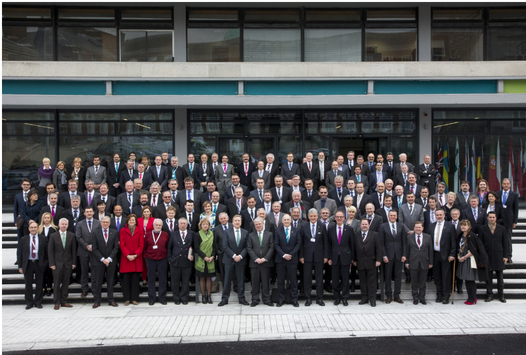
IPC-meeting in Dublin, 2013

by unanimity and the non-binding character of adopted conclusions. 37 It is based on Art. 10 of the Lisbon Treaty and is a platform in which the 28 national parliaments and the European Parliament are represented. 38 The first meeting was held in Cyprus in September 2012 and as chairmanship is in the hands of the EU chair, the next meetings will be in Greece and in Italy. Discussions on the exact set-up of the IPC are still ongoing. France is most in favour of a firmer institutional base for the IPC. Interestingly, within the framework of the IPC, the Dutch delegation has taken the initiative to table a position paper for the meeting in Athens in early 2014 on parliamentary procedures for the deployment of armed forces. It is a first attempt to exchange views on the various procedures and practices across the EU. 39