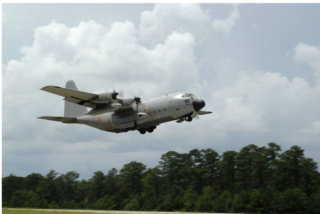
Belgian C-130 military transport aircraft, functioning, among others, under operational command of the EATC in Eindhoven, source: wikipediacommons .

Belgium is nevertheless involved in a multitude of initiatives in which the Netherlands, France and Luxembourg are the main partner countries. In the field of defence cooperation, the Belgian-Dutch Navy Cooperation (Benesam) is a good example of bilateral cooperation. This is most apparent in the manner in which the cooperation in respect of frigates and mine countermeasure vessels is arranged. The basis for this cooperation is the use of the same platforms. Both the Netherlands and Belgium have the same multipurpose frigates and mine hunters. The agreed division of responsibilities between them is that Belgium maintains the mine hunters and provides for the training of their crews, and the Netherlands does the same for the multipurpose frigates and their crews. Although they share an operational headquarters in Den Helder (NL), the Netherlands and Belgium still decide entirely independently of each other on the operational deployment of their vessels with their own crews. Common facilities for education and training, for logistics and maintenance do not encroach upon national sovereignty in decision-making on deployments. For example, both countries decided during the Libya crisis in 2011 to pull out their respective national crew members from each other's vessels.