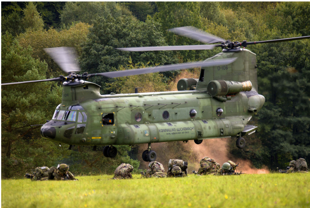
A Chinook helicopter in action during the 1 (GE/NL) Corps' multinational exercise Peregrine Sword in 2012

As much as the extensive role of parliament is guarded by the Germans, they are relatively open to cooperation with other countries. Since decades Germany has shown itself to be willing to integrate, but in recent years more initiatives for practical cooperation have been taken. Prime examples are the Eurocorps (a German-French initiative, later joined by Belgium, Spain and Luxembourg), a Franco-German Brigade (operational as such in Mali in early 2014), the Multinational North-East Corps (Germany, Poland and Denmark) and the German-Netherlands Corps (consisting primarily of a GER-NL high readiness headquarters). Germany, together with France, took the initiative to establish the now five-nation-strong European Air Transport Command (EATC). The Eurocorps formed the core of the SFOR Headquarters in Bosnia and Herzegovina and KFOR Headquarters in Kosovo. Also, the German-Netherlands Headquarters has been deployed on a number of occasions in Afghanistan.