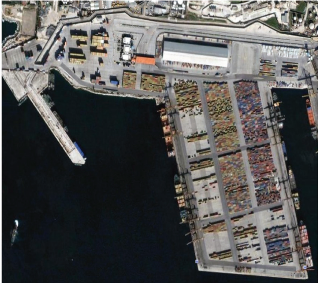
Photo of pier III (left, under construction) and pier II (right, operational) of the Piraeus container terminal, both of which are included in Cosco's 2009 concession.