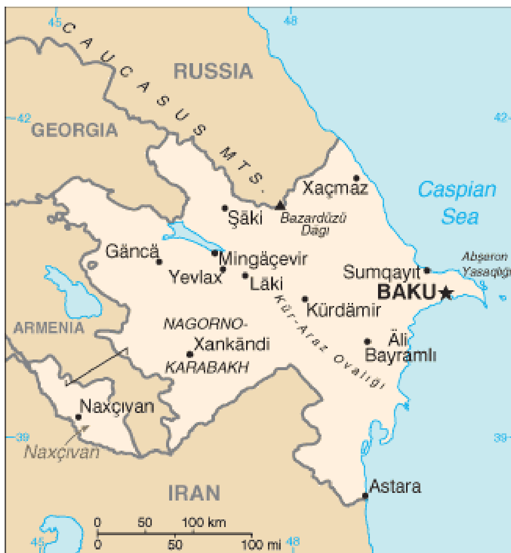
Map of Azerbaijan 76